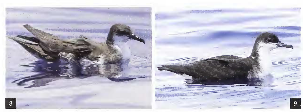
Figures 8–9. Mohéli Shearwater Puffinus ( persicus ) temptator , off Mohéli, Comoros, November 2014, with adult on left (recently moulted inner primaries) and a newly fledged juvenile on right, which has a more delicate greyish bill, blacker upperparts with a more sharply delimited cap, but less marked breast-sides; this taxon often appears to have a dark mask around the eye, especially in adults

surface, then boobies join in, while frigatebirds attack some of the other seabirds. As the flock disperses (or follows the terns), some of the longer/deeper diving shearwaters emerge on the surface, and take off. The primary driver of these feeding frenzies is the tuna and other large-fish predators that attack the sardine shoals, with the location and depth of these aggregations changing daily. Mohéli Shearwaters occurred in such aggregations off all of the surveyed islands, but (at least on 4 November) most were found over and at the edge of the shallow oceanic ridge connecting Grande Comore and Mohéli (12°07S, 43°38E), where shearwaters were observed to forage in association with two Blue Whales around sardine shoals at the north edge of the oceanic ridge (12°04'S, 43°38'E). Several shearwaters were simultaneously observed diving alongside a whale's rostrum, escaping just as the whale closed its mouth.